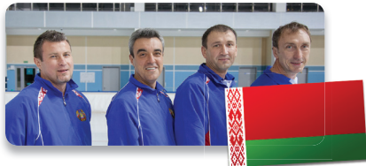
BLR - Belarus