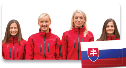
SVK - Slovakia