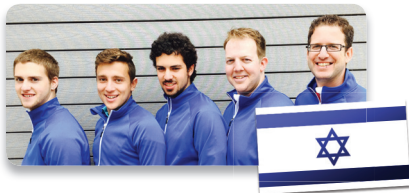
ISR - Israel