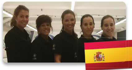
ESP - Spain