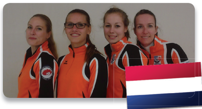
NED - The Netherlands