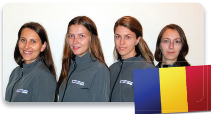
ROU - Romania