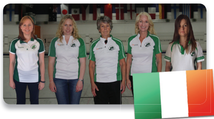
IRL - Ireland