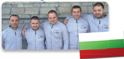
BUL - Bulgaria