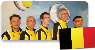
BEL - Belgium