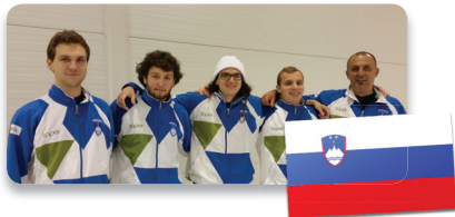
SLO - Slovenia