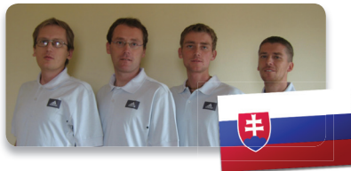
SVK - Slovakia