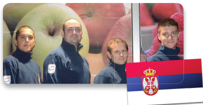
SRB - Serbia