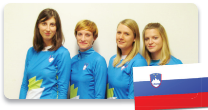
SLO - Slovenia